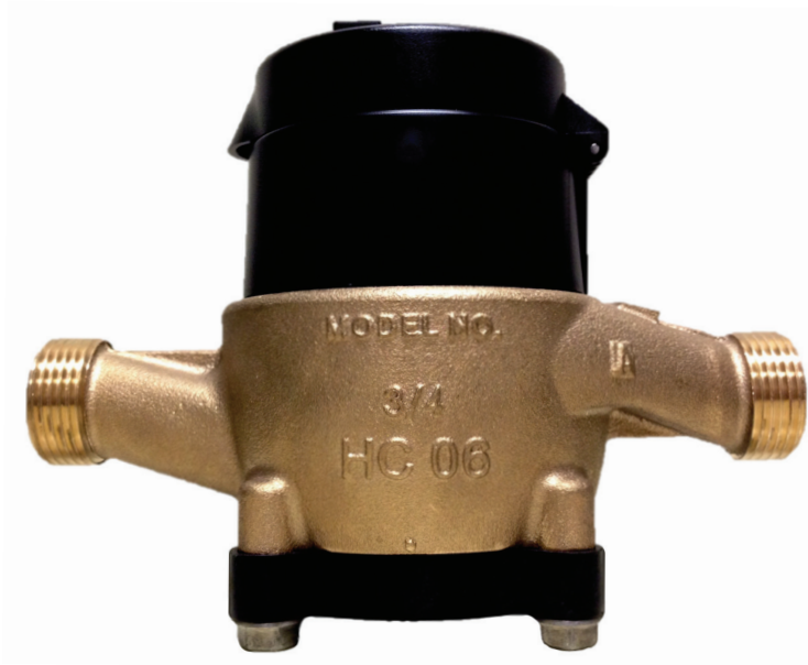
3/4" x 7 1/2" HC meter body with 1" chamber pictured above.

Master Meter created the High Capacity Multi-Jet Meter as a targeted residential measurement solution where increased water flow of up to 150% is needed without any modification to the meter setting or plumbing installation. This is a cost effective remedy to customer service issues resulting from low water pressure and insufficient flow needed for today's high capacity requirements.